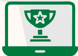
Online Reputation Executive