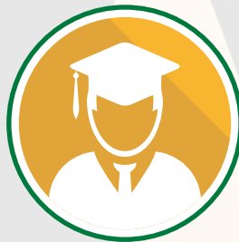
GRADUATES/ POST GRADUATES