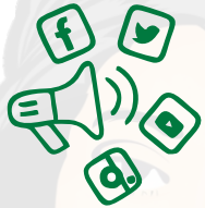
Social Media Analyst