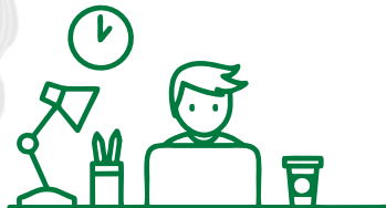
Freelance Digital Marketer