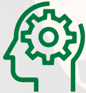
Content Marketing Executive