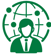
Digital Marketing Executive