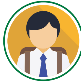
SCHOOL GOING STUDENTS